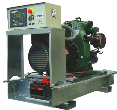
OPEN SET (HSR)