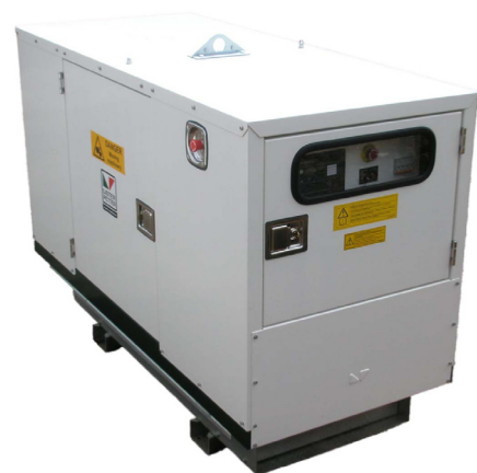
ACOUSTIC SET (HSRA)