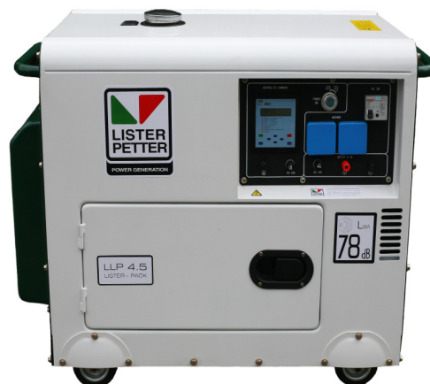
LISTER PACK GENSET