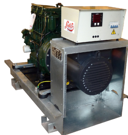
HSL 24 SAVER GENSET