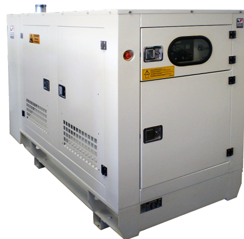
GAMMA ACOUSTIC GENSET